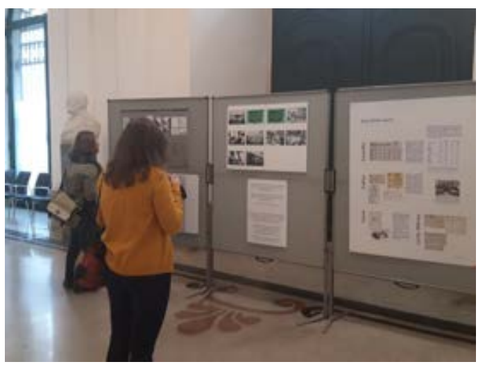
Small exhibition at the conference.

Apart from a planned conference publication, the topic of humanitarian aid in Central Europe has will produce a number of and publications in the coming years. Thanks to a recent Botstiber Fellowship in Transatlantic Austrian and Central European Relationships at the Institute for Advanced Study in Budapest, I recently completed the book manuscript, Budapest's Children: