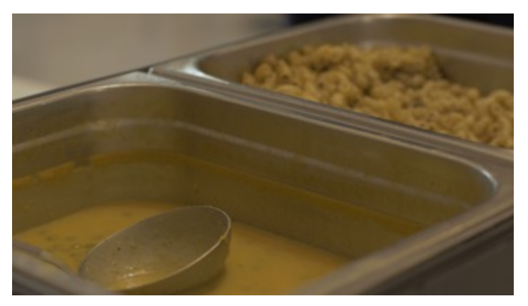
Lentil dish and meat-noodle dish.

The lentil dish and the meat-noodle dish were prepared after historical recipes. Instead of cocoa, we, however, received a coffee. The idea to make donors physically re-experience children's scarce rations of relief food was already used in Hoover's "Invisible Guest Dinner" that was organized on December 29, 1920, in the grand ballroom of the Commodore Hotel in New York City to collect donations for Europe's starving children from the capital city's financial elite.<sup>4</sup> Yet, prior to this contemporary "Invisible Guest Dinner" in Vienna of 2019 most attendants had been quite aware of children's destitution back then. Conference attendants had been either involved in historical research about humanitarian aid back in postwar Europe or were the descendants of those children who had benefitted from Hoover's relief or the postwar children's trains. Therefore, this conference succeeded in enabling a discourse among scholars, descendants and representatives of transatlantic institutions about past and future research endeavors.